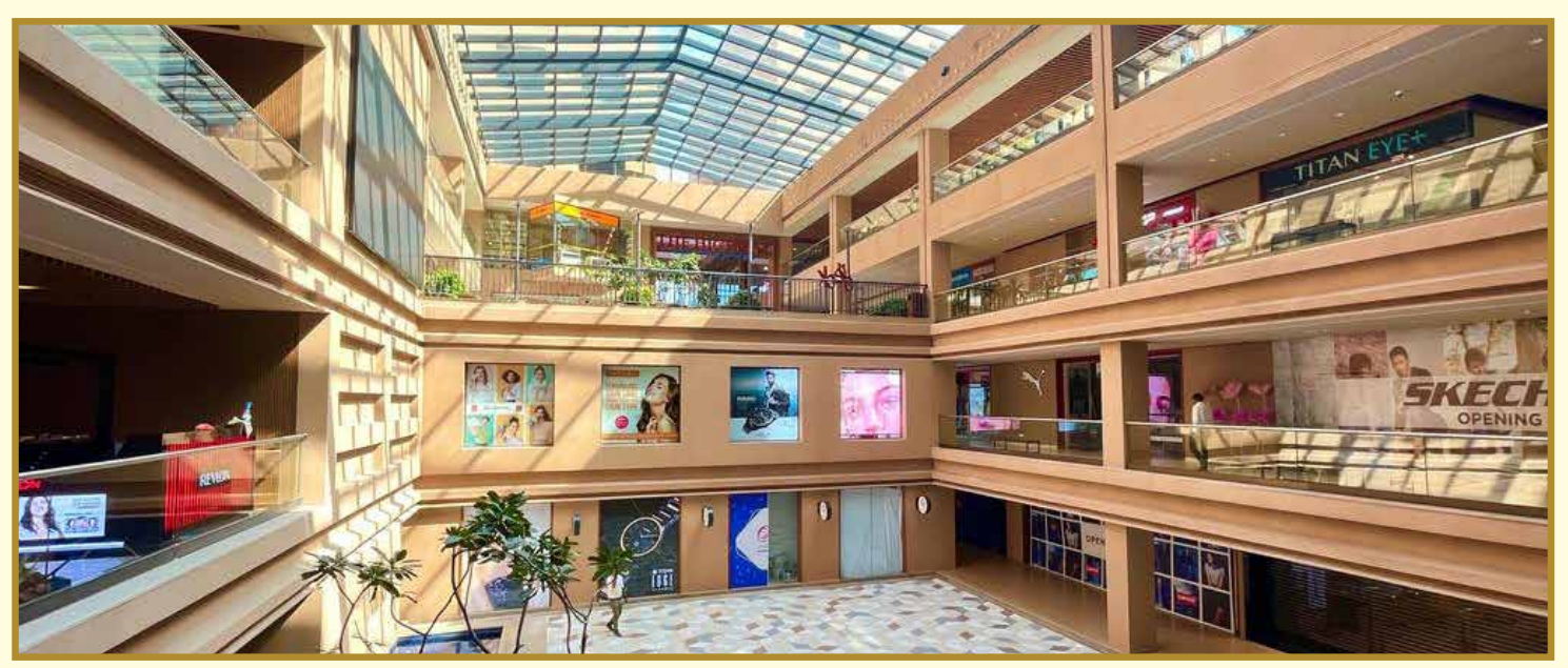
The expansive atrium with a top cover letting in ample sunlight at City Centre Patna