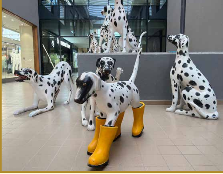
This cute set of Dalmatian installation adds charm to the interiors