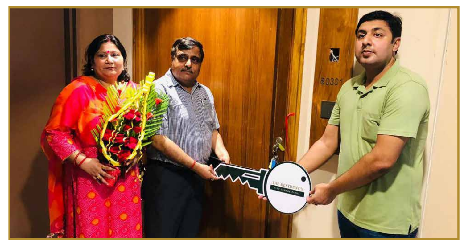
It was a special occasion worth remembering for each of the proud owners of apartments at the Residency Patna, as the keys to their new homes were handed over with a sweet celebration. Highlights from the day's events.