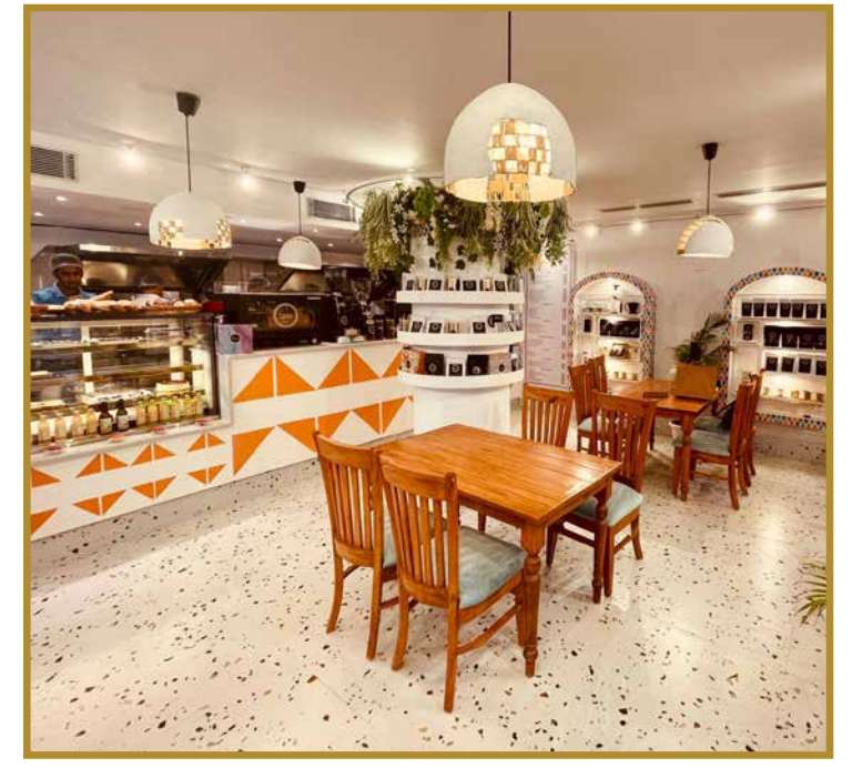
There's more and more happiness brewing at City Centre Salt Lake, as a brand new outlet of Craft Coffee opened inside the Salt Lake mall this month. Enjoy delicious snacks and savouries like croissants and quiche, while sipping on your favourite