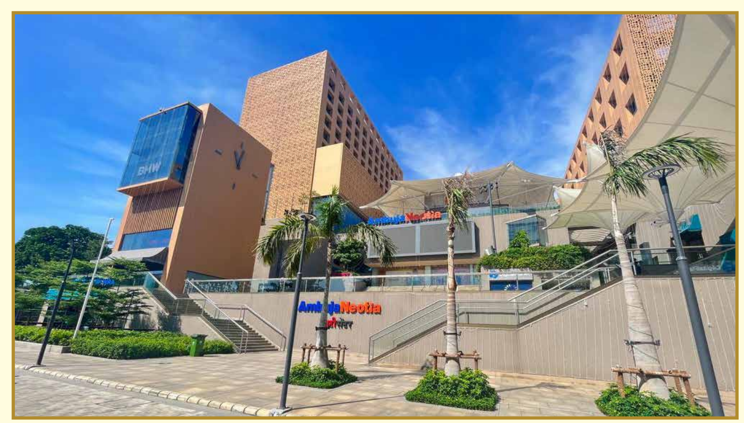
The grand facade of the entrance to City Centre Patna which promises to redefine the city's lifestyle experience

ith the onset of autumnal celebrations of Navaratri and Durga Puja. City Centre opened its doors to V and Durga Puja, City Centre opened its doors to the people in Patna, promising to make a difference to the way people live, work, shop and access entertainment in the Bihar capital, as well as create a positive impact economically.