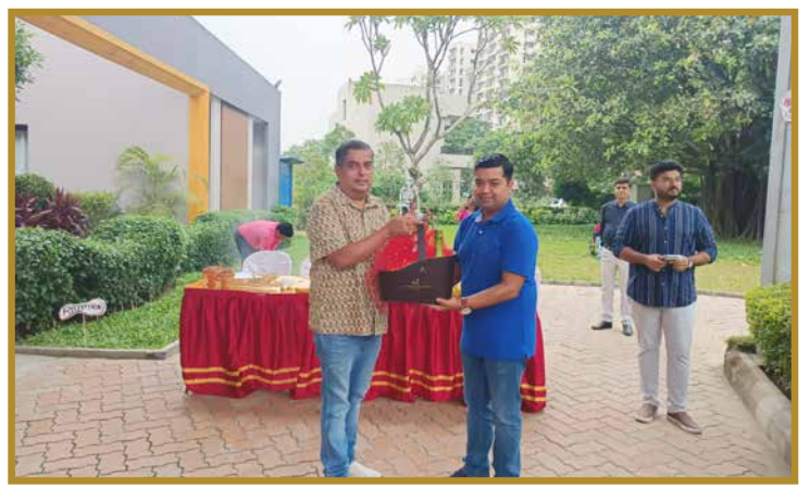
Residents of Usshar the Condoville ushered in Diwali and Kali Puja with cheer and celebrations. Fun activities like mehendi art, fireworks and lots of food kept them happily engaged. Some were lucky to get Diwali-special gift hampers.