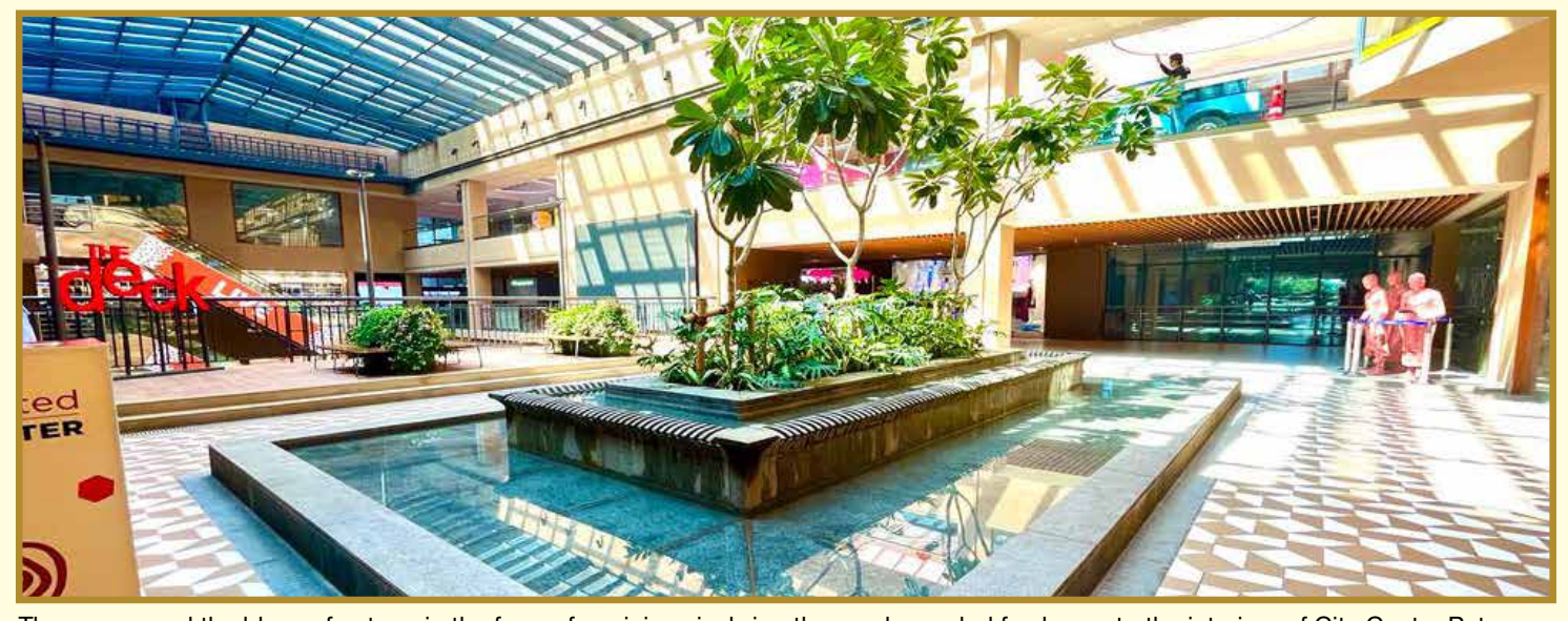
The greens and the blues of nature, in the form of a mini oasis, bring the much-needed freshness to the interiors of City Centre Patna