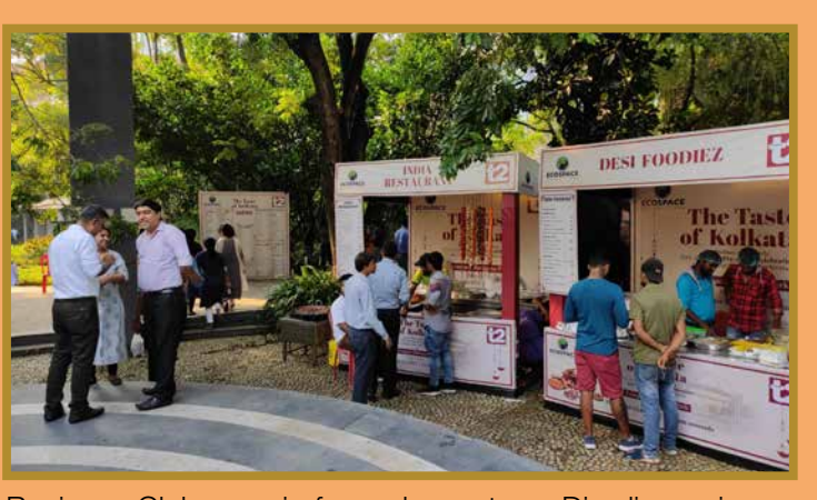
Working professionals and residents in and around Ecospace Business Club were in for a pleasant pre-Diwali surprise as the amphitheatre turned into a gastronomic arena with 'Taste of Kolkata', a food festival offering dishes from some of the most popular contemporary food stops across Kolkata. From kebabs and biryani, sweets and shawarmas, fish fries and rolls, cutlet and more - the three-day festival had foodies queue up for a fun-filled feast.