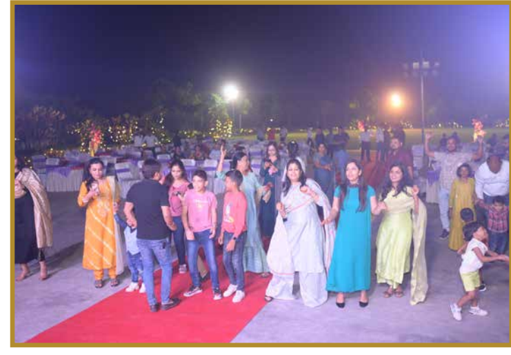
tsodhaara Teesta Township decked up bright to usher in the festival of lights. A special cultural programme was organised to make the evening memorable.