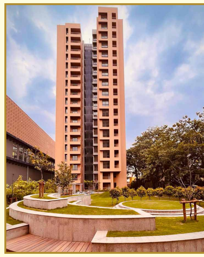
The Residency, City Centre Patna

With an impressive array of leisure pursuits, City Centre Patna promises the ultimate, cutting-edge shopping experience. Over the years City Centre is expected to emerge as the lifestyle landmark of the city, creating memorable experiences.