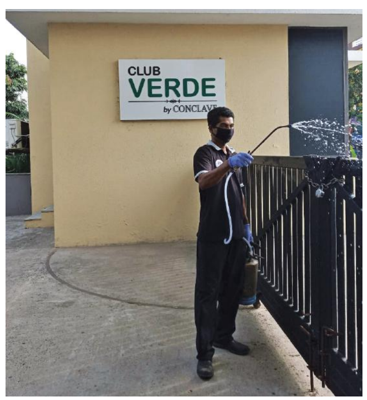
The main gate at Club Verde is sanitised every day