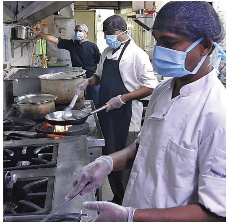
Social distancing is maintained at The Conclave kitchen