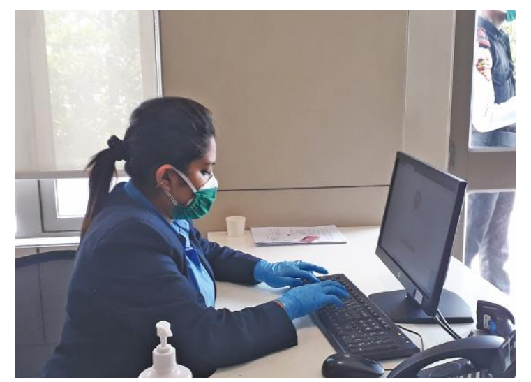
Protective gear worn by hospital staff at BNWCCC, New Town