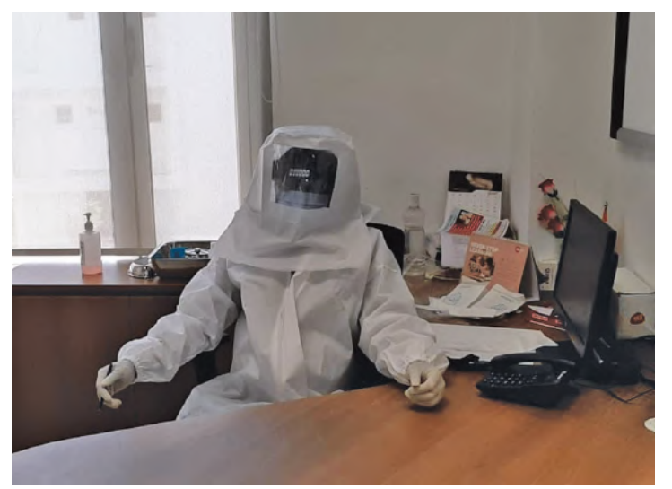
PPE worn by our consultant at the OPD at BNWCCC, New Town