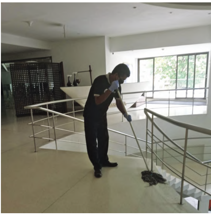
Club Verde is making an all-out effort to keep its premises spotless