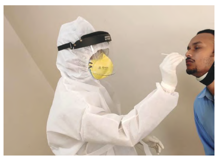
Phlebotimist wearing PPE during swab collection at NGHC, Siliguri