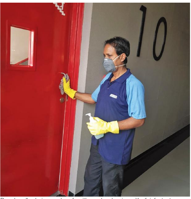
Door handles being made safe with regular cleaning with disinfectants