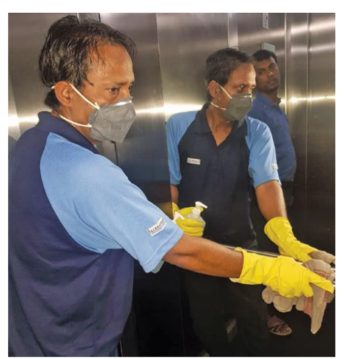
Cleaning lifts on a regular basis to counter any infection

Dusinesses and employers must play a significant role if we are to stop the spread of COVID-19. To stay safe and protected several hygienic measures are being taken across our commercial properties. Regular cleaning with disinfectants across all corners and frequent touch points like railings, handles and lift buttons are being strictly carried out along with fumigation every evening. Also, face masks are obligatory and not a replacement for established preventive practices, such as physical distancing, cough and sneeze etiquette, hand hygiene and avoiding face touching. It is essential that workers use face masks properly so that they are effective and safe. Thus it is compulsory to wear masks and gloves for all security and housekeeping staff. Masks are also a must for all visitors and employees as is sanitization and body screening at all entry points.