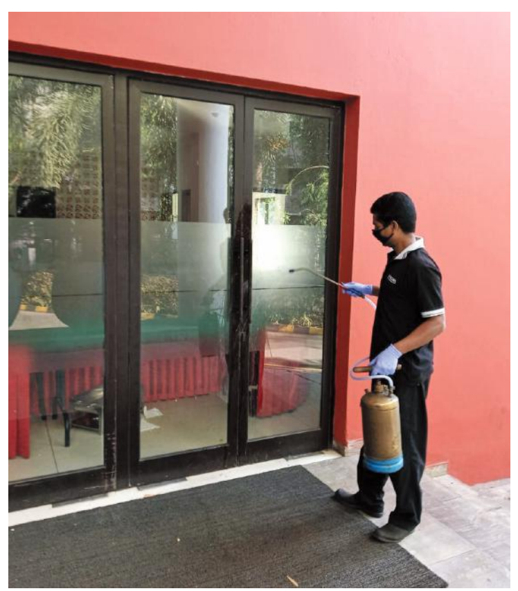
All doors and handles are sanitized on a regular basis by inhouse staff

leanliness is next to godliness and in these difficult times this proverb takes on fresh significance at all our clubs. We are in the midst of an unprecedented, worldwide pandemic, but it helps to know that we are all in this together. Therefore, we continue to put plans and procedures in place to minimise the impact and be able to continue to provide the highest quality of services you need. As the current scenario evolves and helps us to embrace the new 'normal' lifestyle and resume our daily routine, Ambuja Neotia has taken strict health and hygiene initiatives to keep the experience of customers and stakeholders intact but under proper safety measures. From wearing masks, using temperature guns, donning caps to using sanitized equipment, proper sanitation and fumigation at regular intervals, we have implemented all guidelines to ensure a safe and sound ecosystem around us along with the sacrosanct mantra of 'Social Distancing.' The Group has pledged to be responsible for the well-being and safety of every stakeholder, thus taking detailed care of work process and functioning of all its verticals.