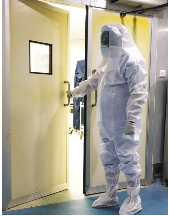
Doctors in PPE suits at Bhagirathi Neotia Woman & Child Care Centre, Rawdon Street