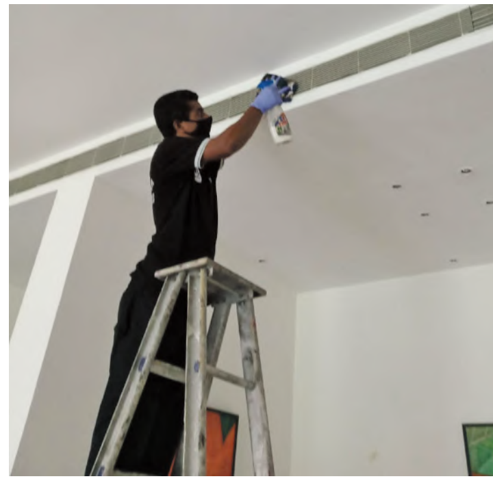
AC Grills being cleaned and sanitised on an on-going basis