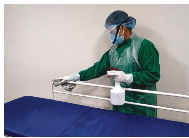
Disinfecting stretchers at NGHC, Siliguri