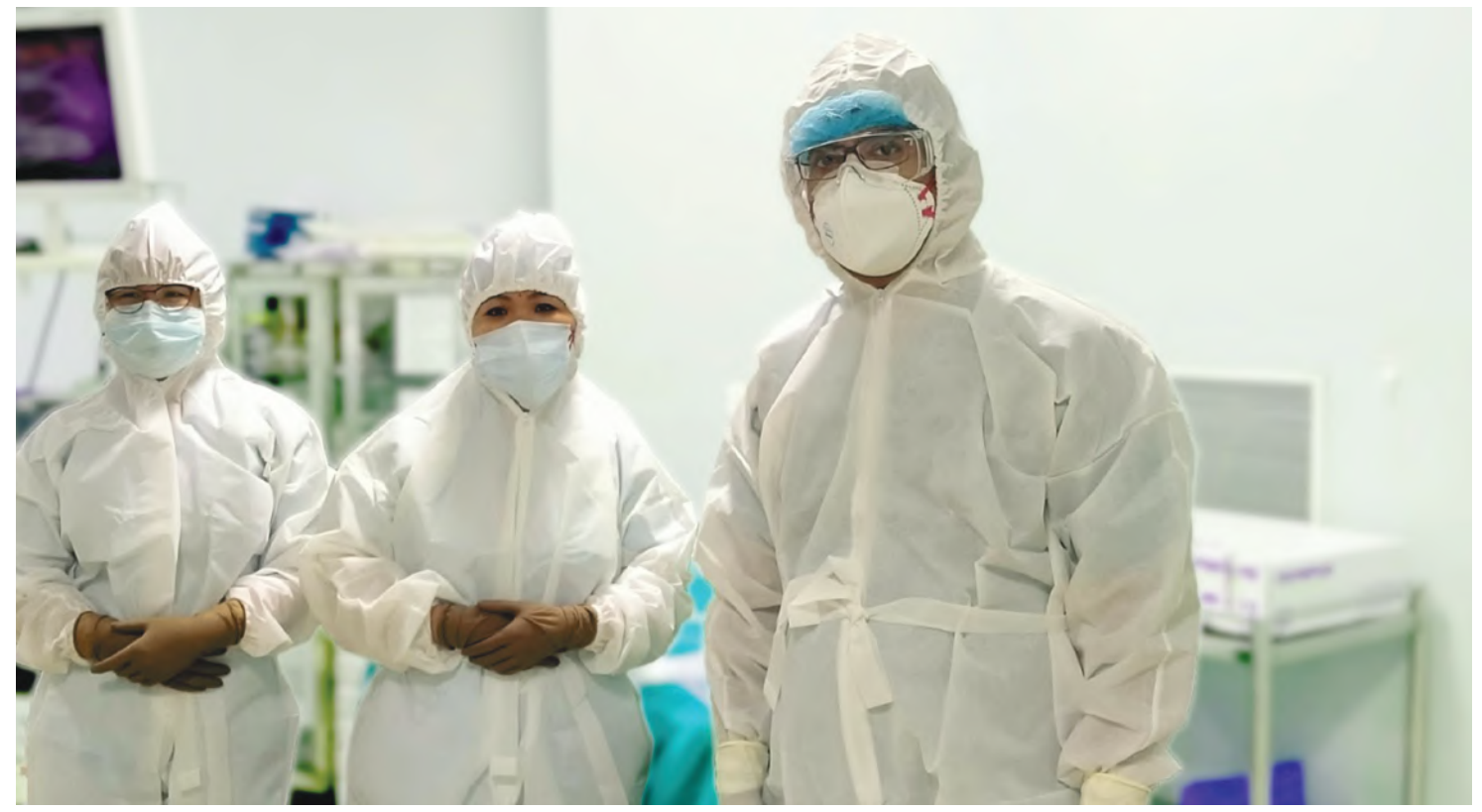
Surgeons, nurses and clinical associates wearing PPE in the OT at Neotia Getwel Healthcare Centre, Siliguri