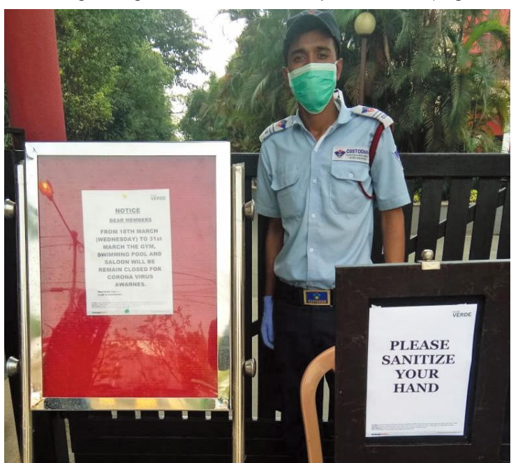
Maintenance staff are provided with mask and hand gloves