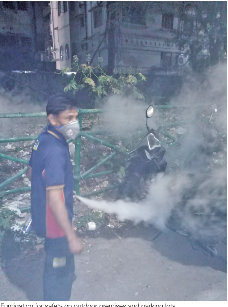
Fumigation for safety on outdoor premises and parking lots