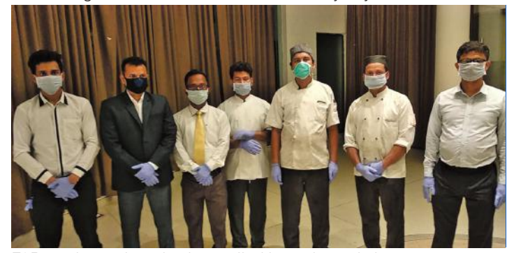
F&B service and production staff with masks and gloves