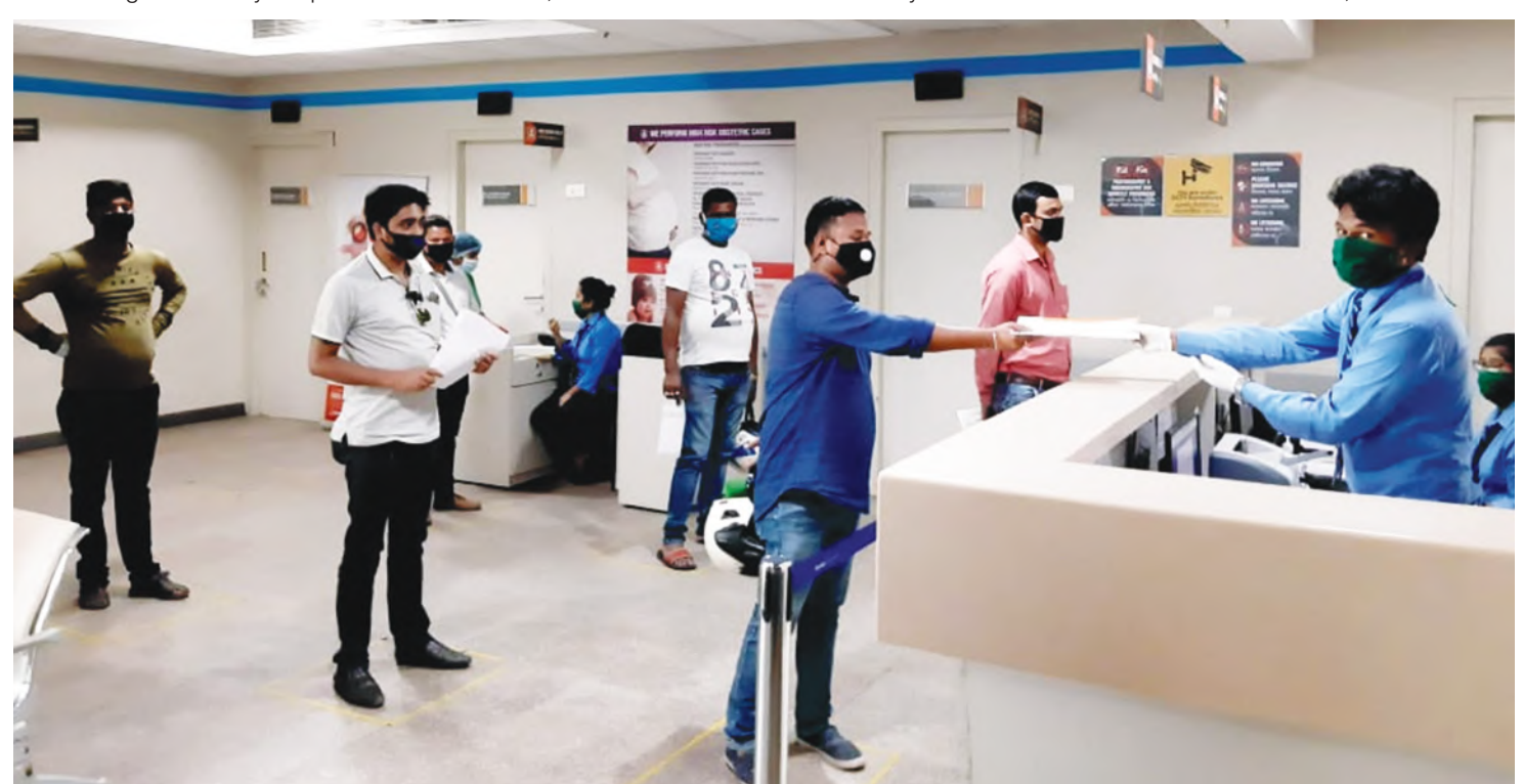
Social distancing is strictly followed during patients' registration at NGHC, Siliguri