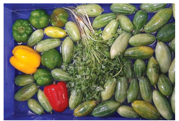
Vegetables are thoroughly cleaned at The Conclave kitchen