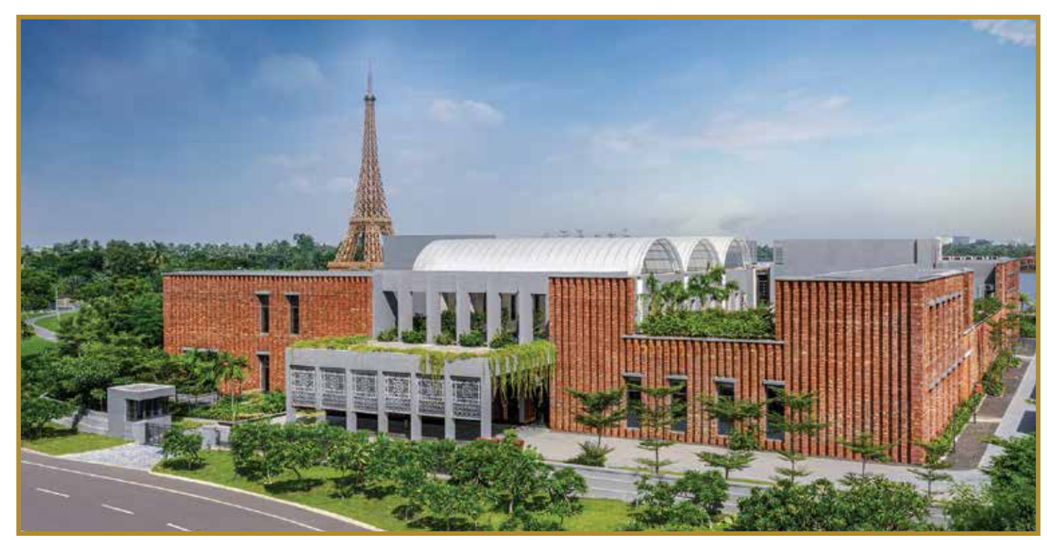
The imposing facade of Taal Kutir Convention Centre in New Town, Kolkata

■ndian Hotels Company's 'Taj' has been named as the world's strongest hotel brand for 2022 according to the latest report of the consultancy, Brand Finance, that has ranked Taj ahead of Premier Inn, Hilton Hotels and Resorts, Hampton by Hilton, Embassy Suites Hotels, JW Marriot and Shangri-La Hotels and Resorts, Residence Inn by Marriot, Waldorf Astoria Hotels and Resort and W Hotels Worldwide, in the top ten strongest hotel brands.