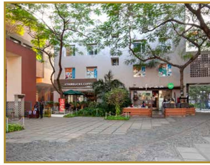
Fine lounging is fun at City Centre with brands such as Afraa and Starbucks drawing the young and the young-at-heart