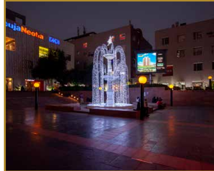
The Kund with its well-lit fountain adds character to the warm and inviting