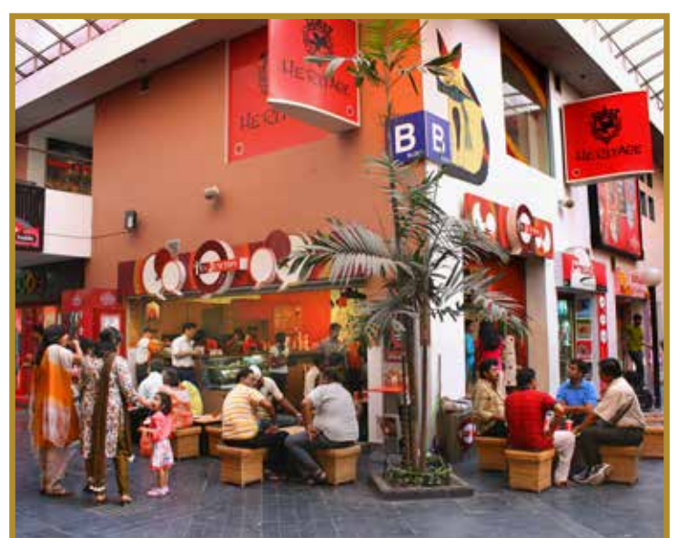
Tea Junction - the favourite adda zone at City Centre