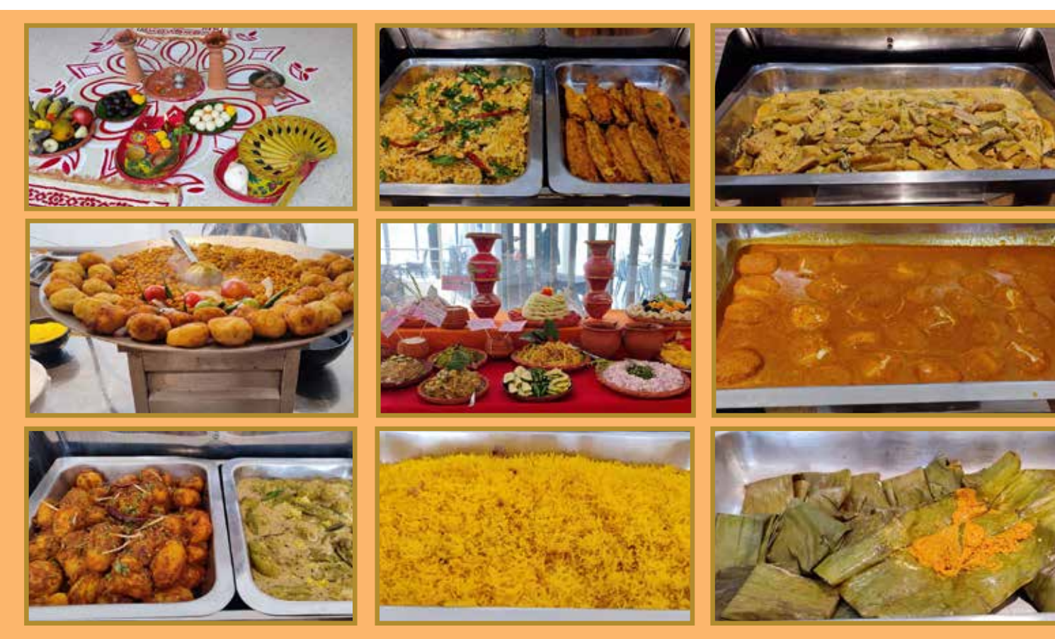
amai Sashthi at Club Verde saw the venue set for the occasion with an array of delectables and live music to celebrate precious family bonds. Sons-in-law had a field day, hogging the limelight.