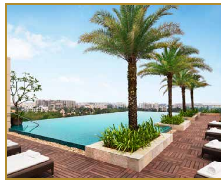
The infinity swimming pool at Taj City Centre New Town