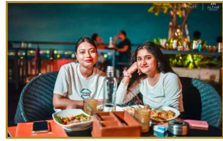
Recently, AltAir mounted a glittering night featuring DJ Helixy, playing EDM Commercials to much foot-tapping.