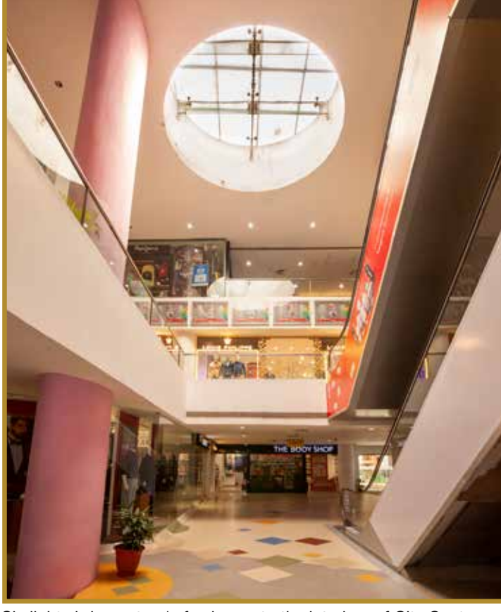
Skylights bring nature's freshness to the interiors of City Centre

Identified by its inclusiveness, uniqueness and diversity, City Centre Salt Lake from the very beginning has been a place that extends a warm welcome to everybody. With approximately 4.5 lakh sqft of commercial and entertainment spaces on five acres of land, it draws in crowds from all over Kolkata, not just the catchment area. Designed to encourage and celebrate 'adda', to give you a street-feel without the street, the mall is a wonderful example of simplicity, elegance and understatement – its context being very Indian while the experience is youthful and contemporary. Here are some glimpses of City Centre Salt Lake's ageless charishma.