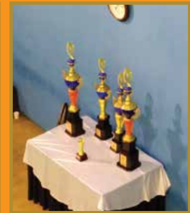
🧥 s the badminton tournament at Club Verde progressed, members were excited to revisit their childhood and thus turned the event into a huge success with much cheering and nail-biting in the spectators' gallery.