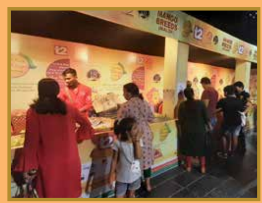
ro celebrate 18 years of City Centre Salt Lake, multiple events have been planned for the months of June and July. The first event on the calendar was 'The Great Mango Festival.' Over a hundred varieties of mangoes were available on sale, along with folk and Baul musical recitals. The two-day festival was much enjoyed by all visitors and patrons.