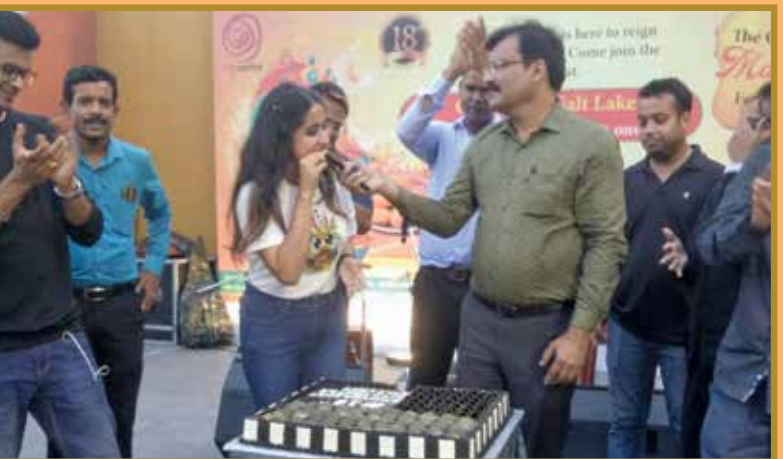
A special cake cutting ceremony marked City Centre Salt Lake's eighteenth birthday with great pomp.