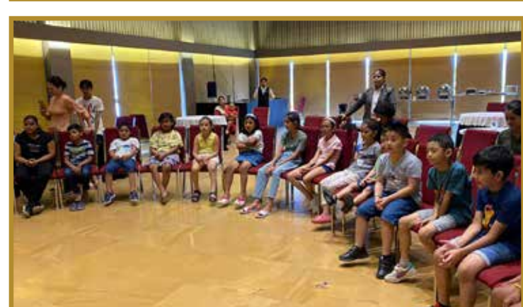
A Summer Camp was recently hosted at Montana Vista for children who thoroughly enjoyed the fun activities over 3 days.