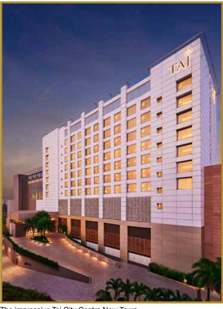
The impressive Taj City Centre New Town