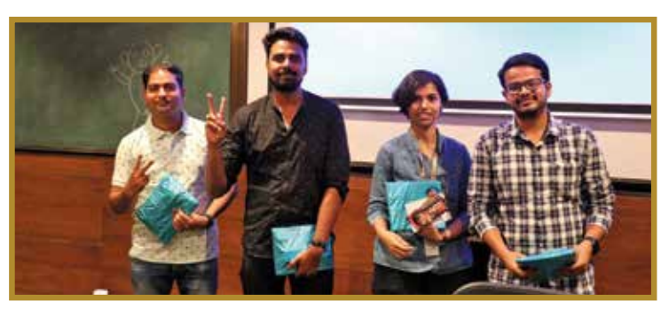
ream HR took everyone back to their school days with Hangman, but with a twist! A lineup of six were quizzed on current affairs, politics and more, making the weekend all about fun and laughter at Ambuja Neotia and spreading happiness.