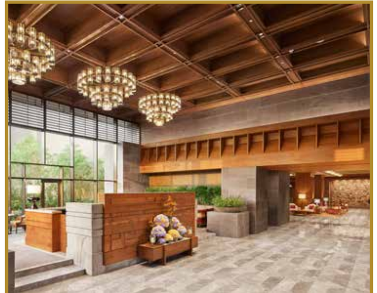
Taj City Centre New Town lobby