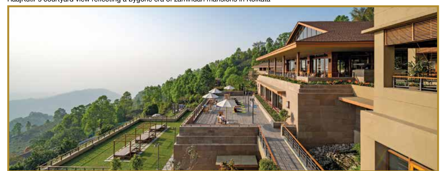
Taj Chia Kutir in Darjeeling overlooking the Makaibari Tea Estate