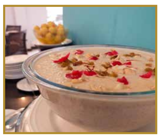
A special Jamai Sashthi buffet was laid out at Montana Vista to pamper sons-in-law over a scrumptious feast.