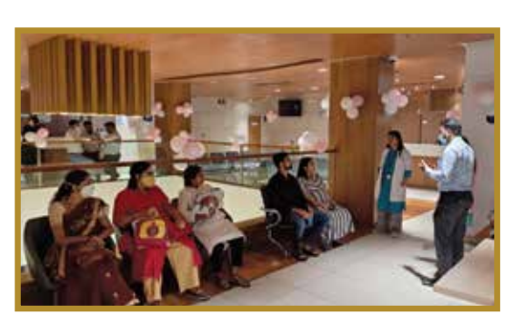
notherhood is nurturing the little life within you from the moment of conception through childbirth and beyond; a lifetime of joy and happiness. Continuing the celebration of Mother's Day in this month, Bhagirathi Neotia Woman & Child Care Centre, New Town, recently hosted 'Mommies Day Out' with pregnant mothers for a fun-filled health session at the New Town hospital premises, much enjoyed by all who attended.