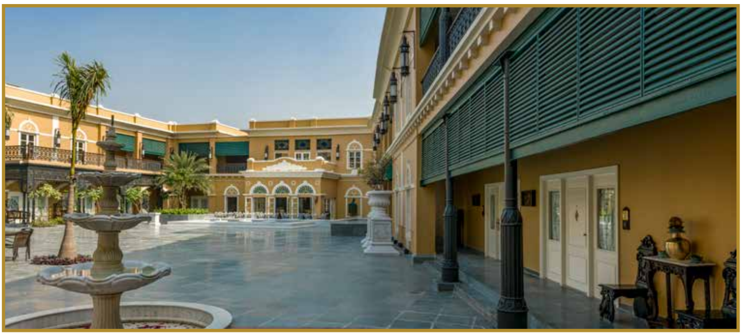
RaajKutir's courtyard view reflecting a bygone era of zamindari mansions in Kolkata