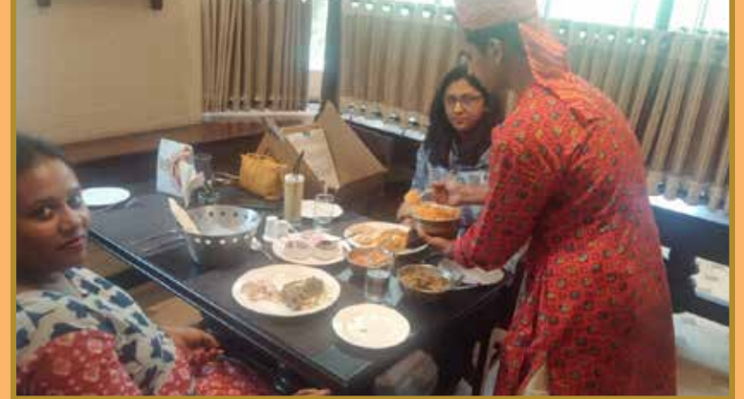
Rajasthani Food Festival at EcoHub was a popular event, with members and guests relishing the specially curated delectables.