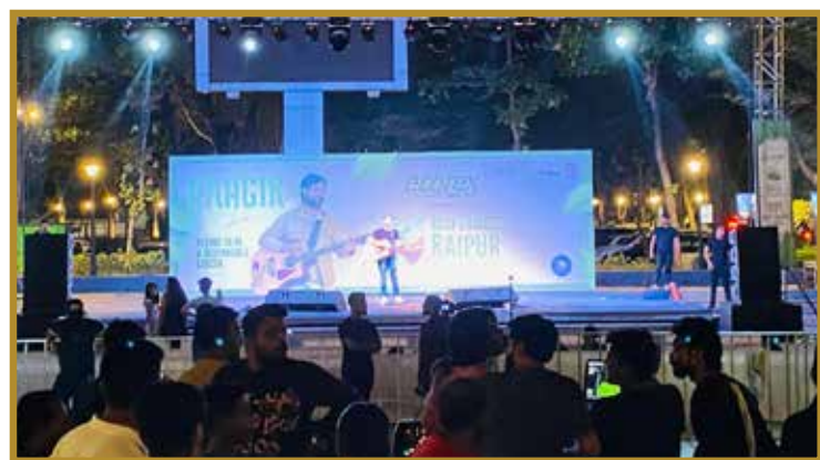
Several events were recently hosted at City Centre Raipur, including a concert by Rahgir, as well as an awareness drive on the harms of smoking on World No Tobacco Day. World Environment Day was also commemorated along with other events.