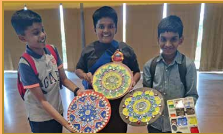
The recently held Lippan Art Workshop at Montana Vista had participants learn a traditional art and enjoy the event.