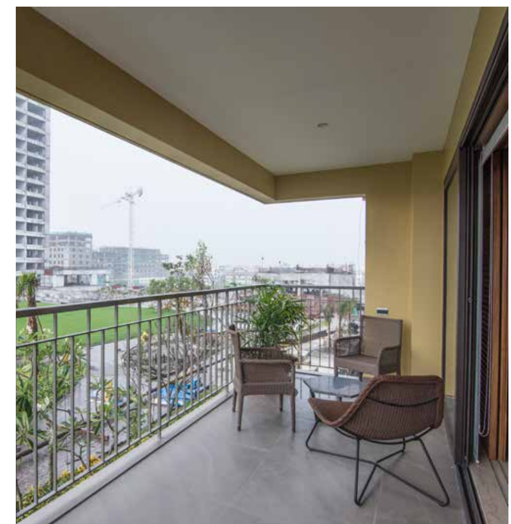
A cup of tea in your own balcony