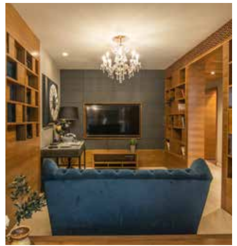
Just the right place to watch television

Space in our homes is becoming a luxury as apartments get smaller and life becomes rushed. Not so in Utalika! Here, after a hard day's work, you can return to the comfort of space in your private nest; to capacious and comfortable bedrooms; to spacious living and dining areas where you can entertain your guests in style; to kitchens that are not cramped and bathrooms that are a private sanctuary. Dress up in privacy in your walk-in closet or snuggle with a book or your iPad in the many cosy corners of your residence. Utalika allows you to do more with your life in the extra spaces we have created for you. With over 350 buyers already booked into the complex, it is now your turn to experience the enormous value that space can create in your life!