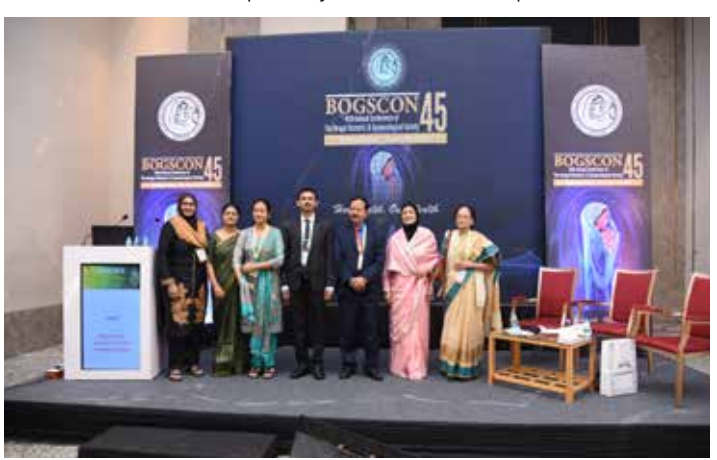
Genome: The Fertility Centre, along with BNWCCC New Town, was proud to be associated with BOGSCON 45, the 45th Annual Conference of The Bengal Obstetric & Gynaecological Society