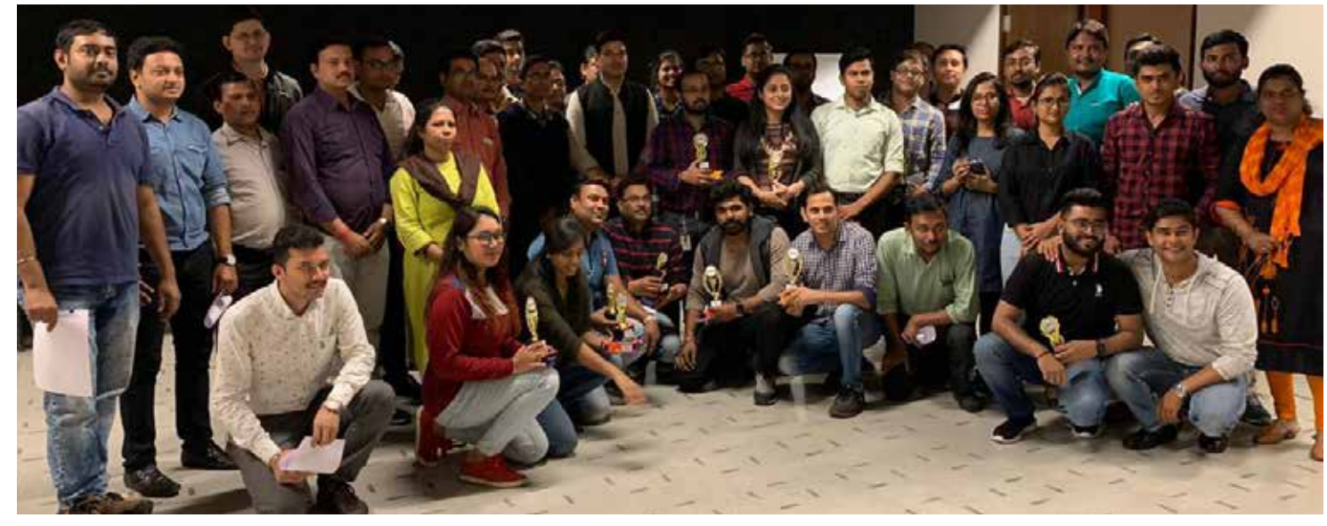
Ambuja Neotia's HR team, in association with TATA Capital, organised a unique employee engagement session. Teams were formed at the venue and made to participate in four different games, each having a significant connect to an employee's journey in an organisation. Starting with the Dart (start of the journey as an individual ), it progressed to Build A Pyramid (building relationships along the way), Drop the Pencil (team building & bonding) and Throw A Ball (team management & leadership). Here are the participants of this interesting session