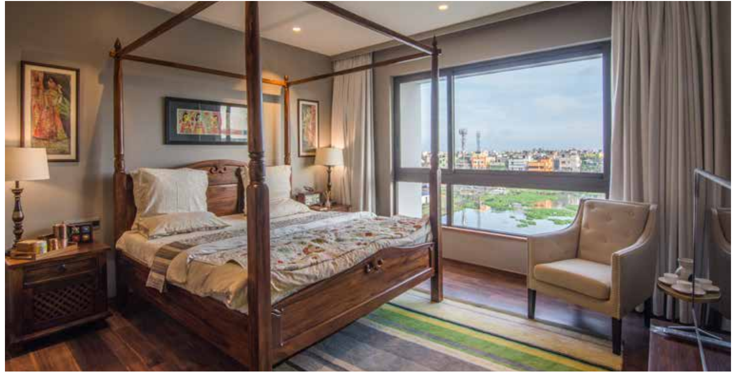
A view of the master bedroom with large French windows that bring the outdoors right inside