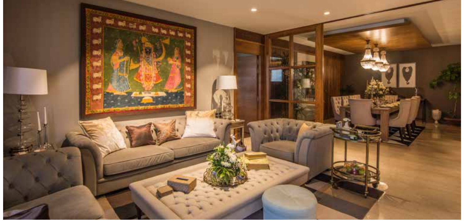
When friends come over, you will be proud of your spacious living room