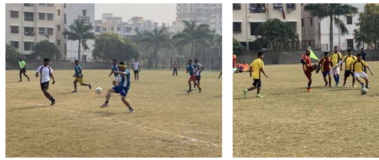
The Ambuja Neotia Knockout Football Tournament 2019 saw 12 teams compete in the time-honoured attitude of sportsmanship. Each team displayed great skill and strategy during this one-day knockout tournament, ending the year in the best tradition of esprit de corps