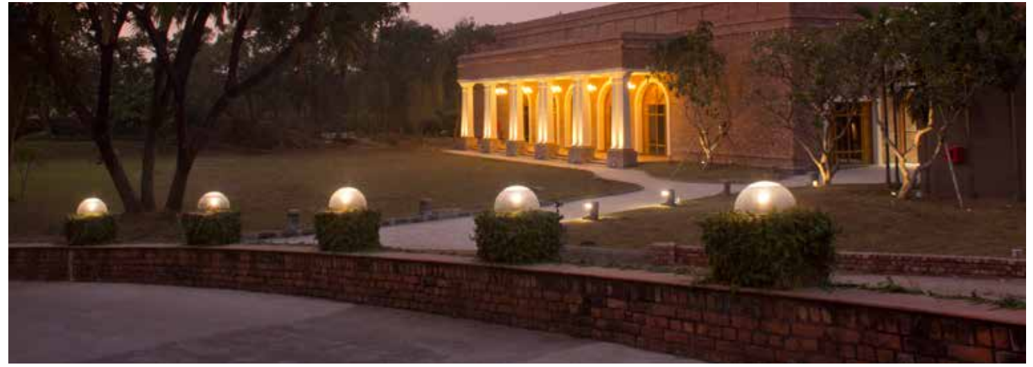
The Royal Bengal Room has an old-world charm