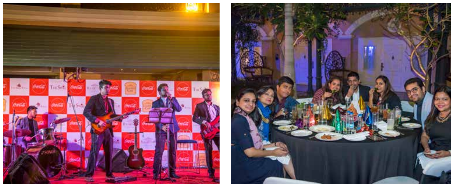
A sparkling soiree was organised at Raajkutir on New Year's Eve, featuring music band Sargamwale, along with a wide spread of gastronomic delights