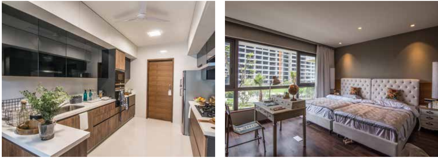
Cooking up a storm in your kitchen area can be fun