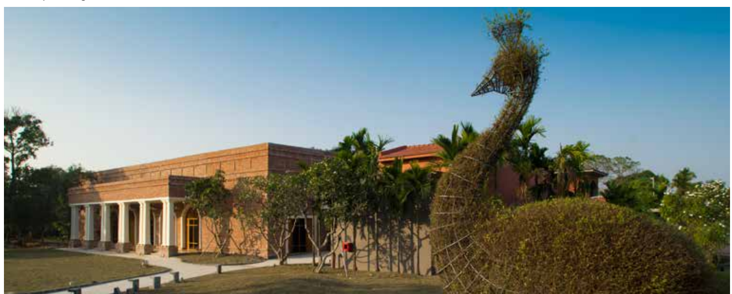
The Royal Bengal Room invokes memories of lodges from a bygone era