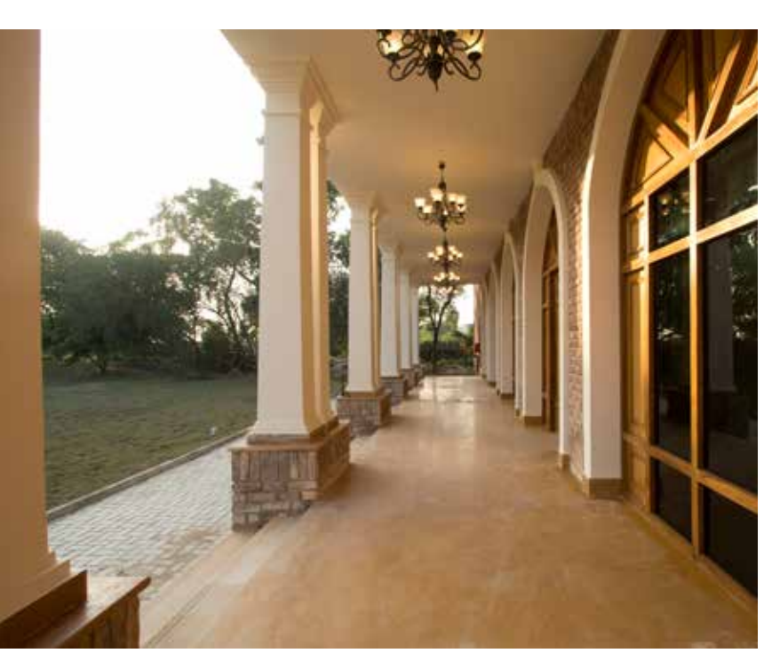
The attached veranda that overlooks verdant lawns