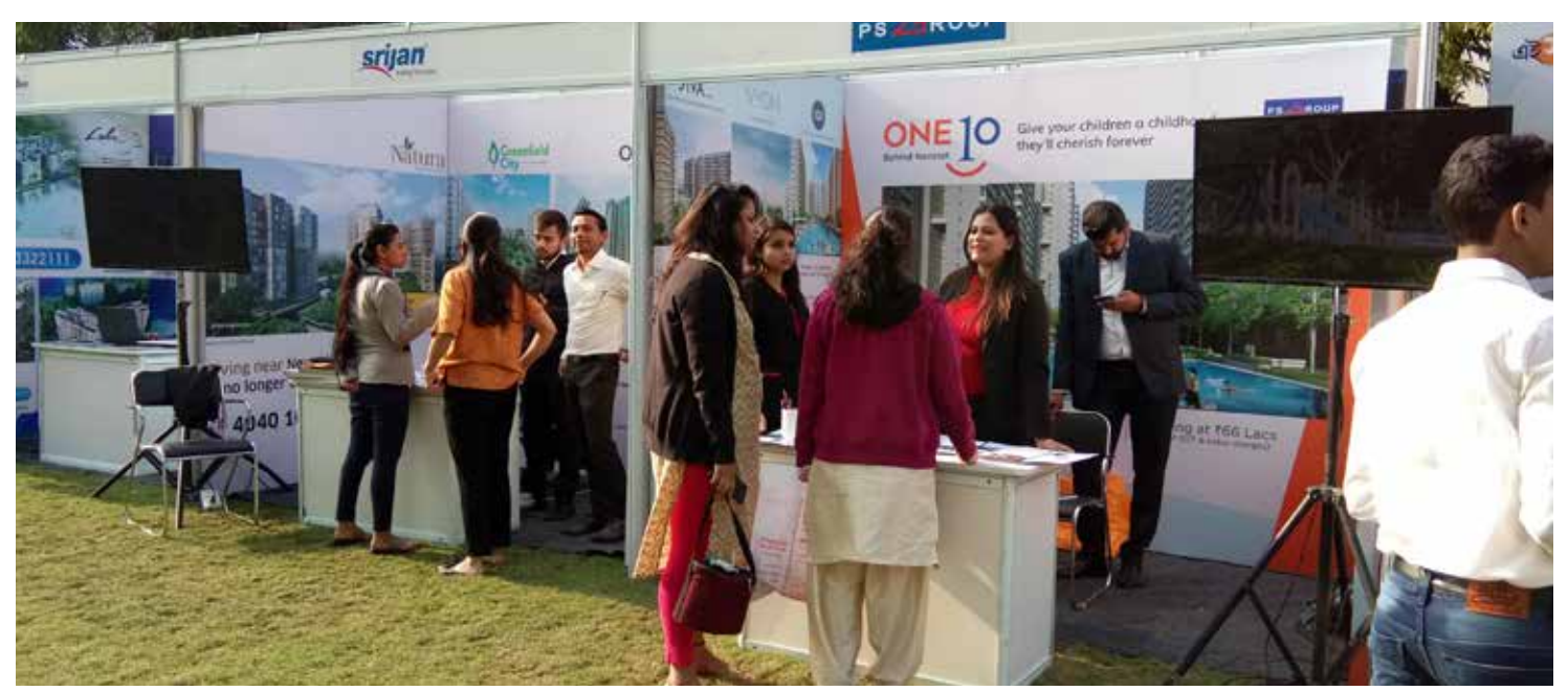
A Real Estate Expo was organised by The Times of India for employees of Ecospace Business Park where 10 developers showcased various residential projects