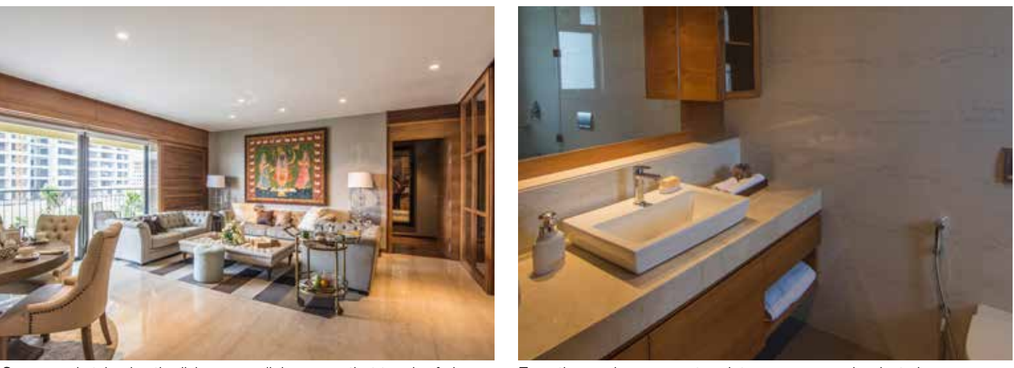
Space and style give the living-cum-dining room that touch of class