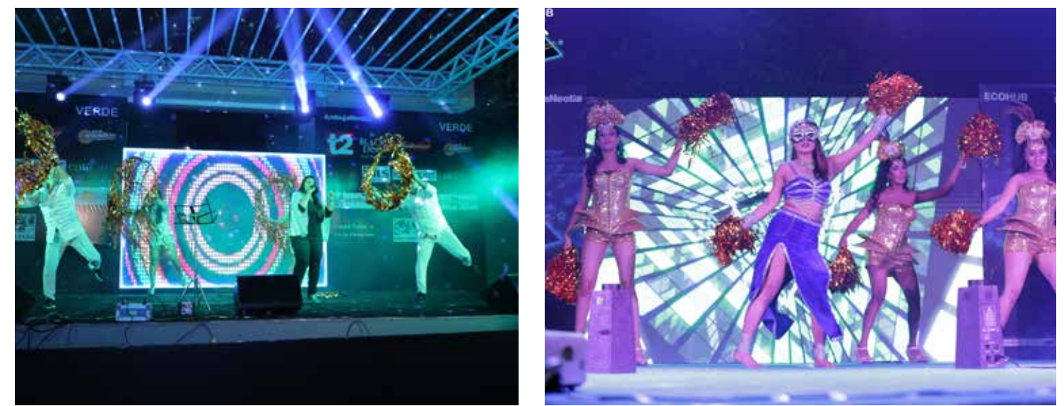
Club Verde celebrated the advent of the New Year with style