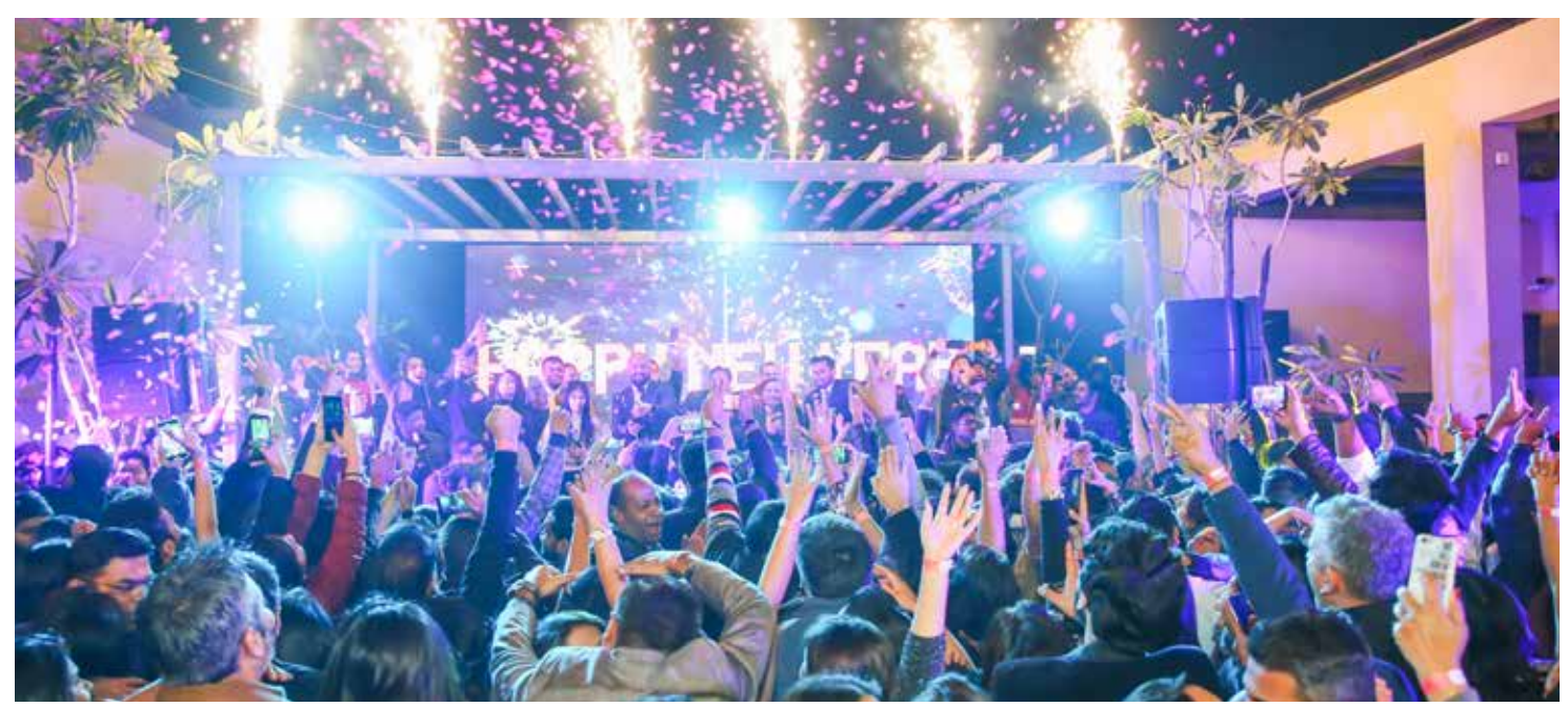
ear was ushered in at Capella, Altair, with food, music, dancing and much merriment