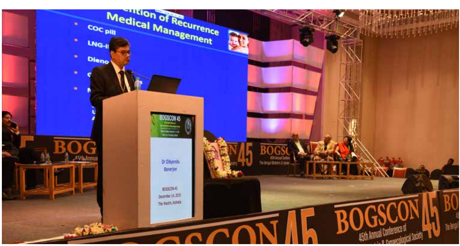
Bhagirathi Neotia Woman & Child Care Centre New Town recently took part in BOGSCON 45, the 45th Annual Conference of The Bengal Obstetric & Gynaecological Society, organised at The Westin, Kolkata