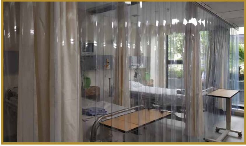
A glimpse of the Isolation Bed at the COVID Ward