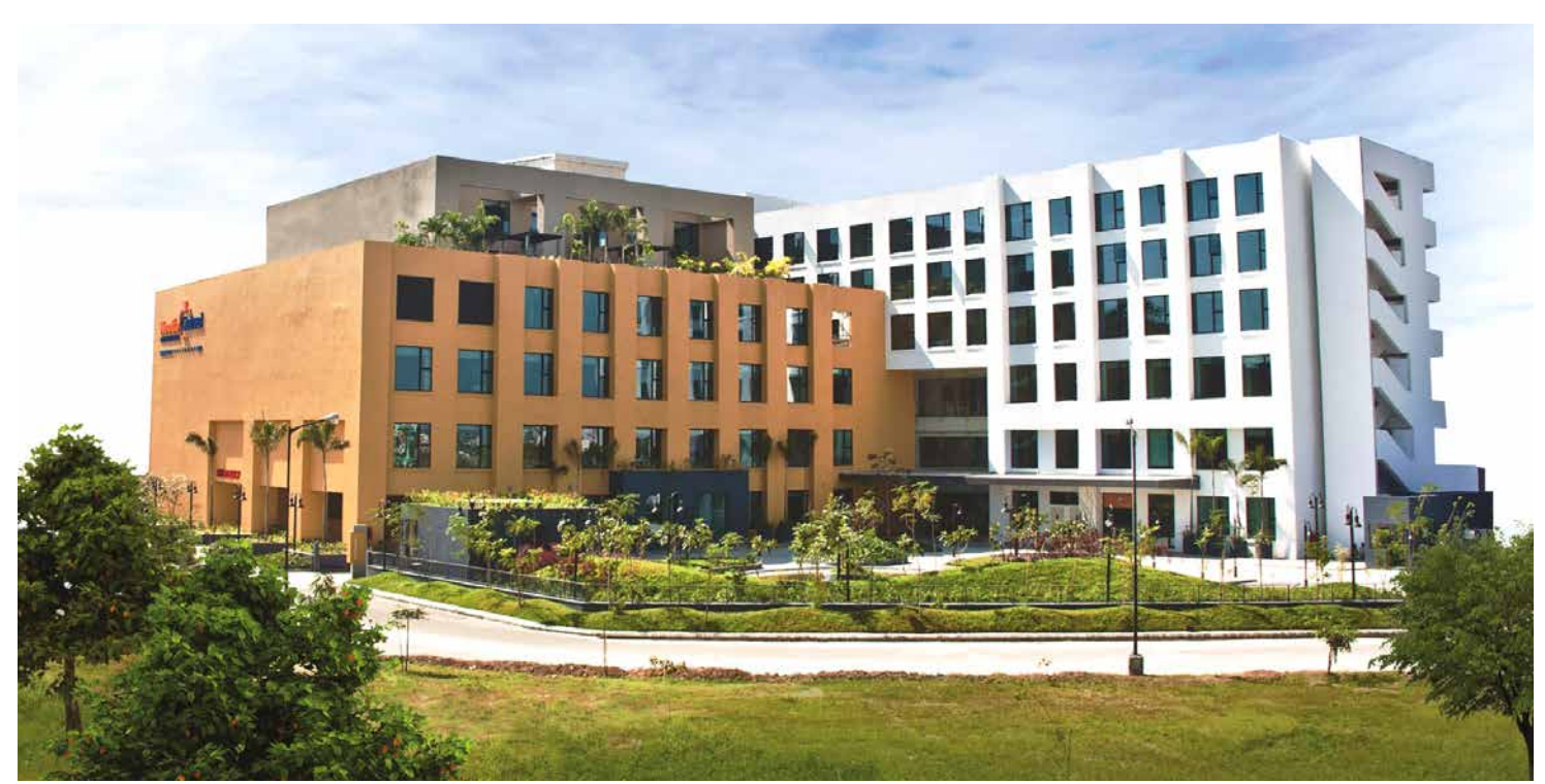
Neotia Getwel Healthcare Centre at Siliguri

Neotia Getwel Health Care Centre at Siliguri now admits Covid patients with safety measures to prevent cross-contamination of non-Covid patients. There is a separate floor for COVID -19 suspected and positive patients. All ISHRAE COVID 19 guidelines for air conditioning and ventilation are being followed. Also in use are medical grade air purifiers with three stage filtration consisting UVGI technology and H14 grade HEPA filters. there are negative air pressure points, with 12 air changes per hour in the room. And, of course, there are designated entry and exit points.