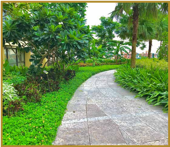
Walk down this path without an umbrella to feel raindrops falling on your head!