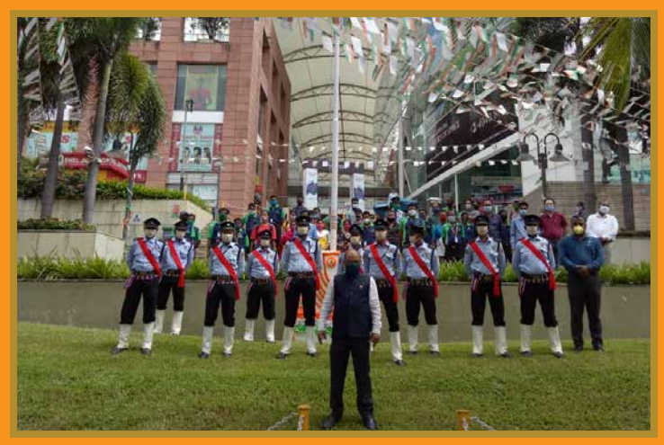
he pride every Indian feels on Independence Day was reflected at City Centre New Town on August 15 morning when our flag was ceremonially hoisted on the premises by the security personnel. Jai Hind!