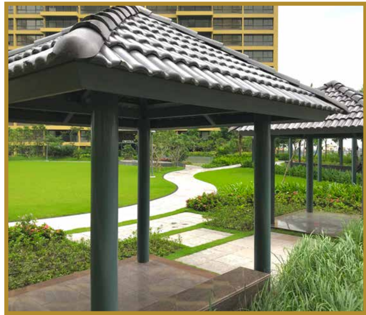
Just the spot to sit and watch the rain fall on fecund grass and flowering beds

'My heart dances today!/ O it dances like the peacock!/ It dances! It dances! Exuberant like the peacock's tail/ Spread out in splendid hues!/ My fervent heart gazes at the sky/ Laden with mad exuberance/ Who is there all alone/ Singing in lazy abandon on the Bakul branch?/ Bakul flowers drop from the tree/ As her sari's loose end flutters in the breeze/ And her wind-blown hair covers her eyes.../ Then, suddenly, her chignon tumbles free!/ The rain pelts down on emerald twigs,/ The groves quiver with the chirping of crickets,/ And the river overflows its banks near my village!/ My heart dances today! O it dances like the peacock...'