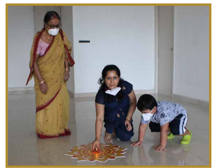
Lighting the lamp of Hope for a blissful future