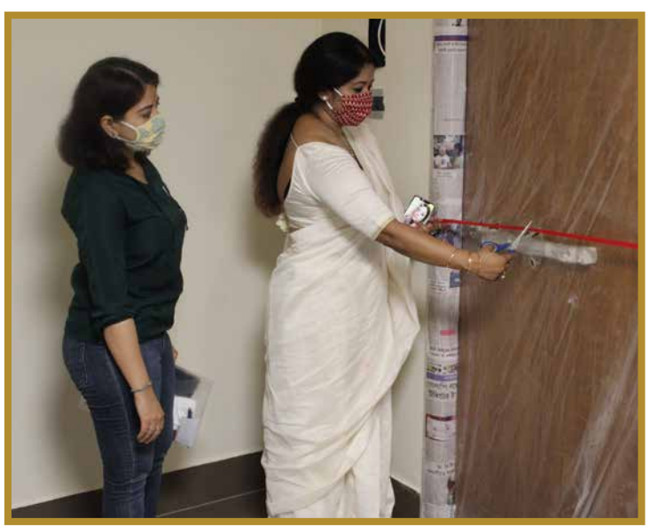
A ribbon away from happiness!