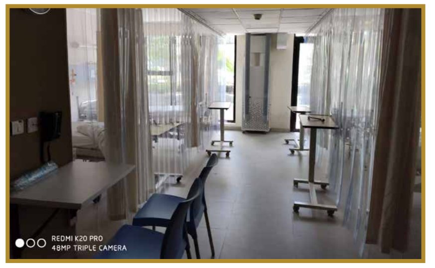
A view of the COVID Ward at NGHCC, Siliguri

In addition, there are enhanced safety measures for patients, rigorous maintenance of infection control protocol, and protective gear meant to be worn by consultants, clinical associates and hospital staff. Frequent sanitization and disinfection of our premises and screening of patients at every point, along with restricted visitors in the hospital, are some other measures the Neotia Getwel Health Care Centre has undertaken to ensure maximum safety.