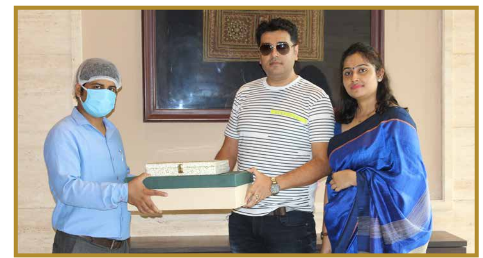
Gifts galore for this family who will soon reside in Utalika