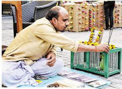
Parrot the fortune-teller