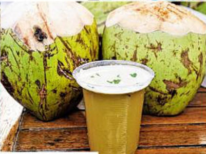
Ganne Ka Juice